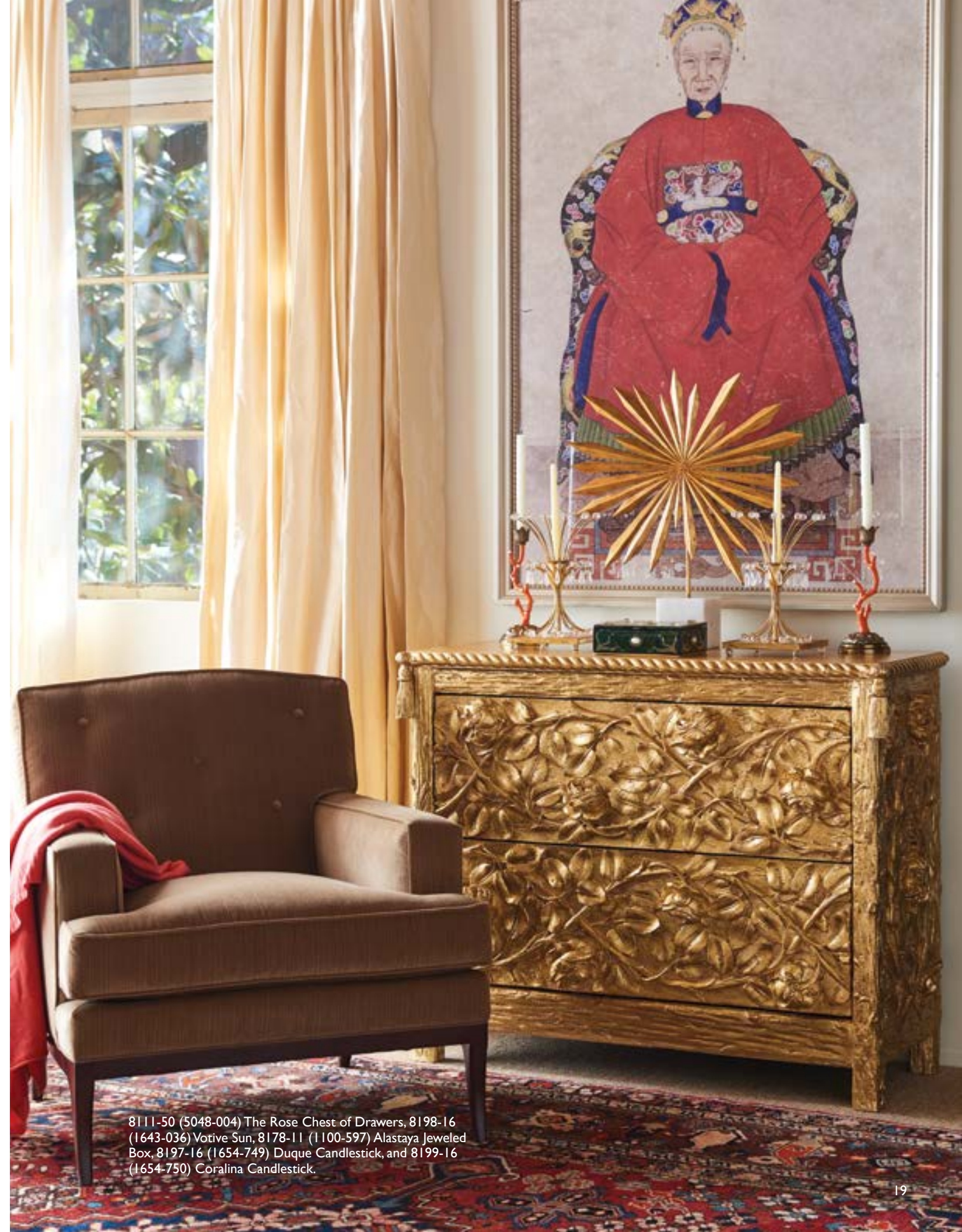
8111-50 (5048-004) The Rose Chest of Drawers, 8198-16 (1643-036) Votive Sun, 8178-11 (1100-597) Alastaya Jeweled Box, 8197-16 (1654-749) Duque Candlestick, and 8199-16 (1654-750) Coralina Candlestick.