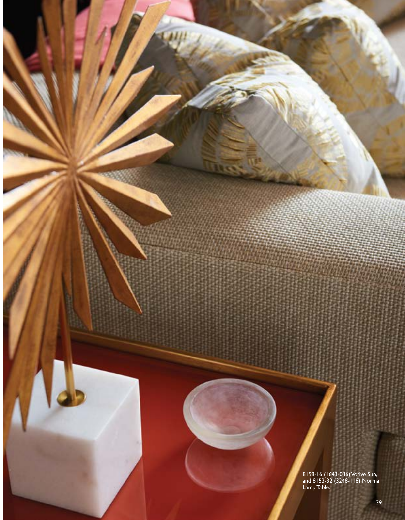
8198-16 (1643-036) Votive Sun, and 8153-32 (3248-118) Norma Lamp Table.