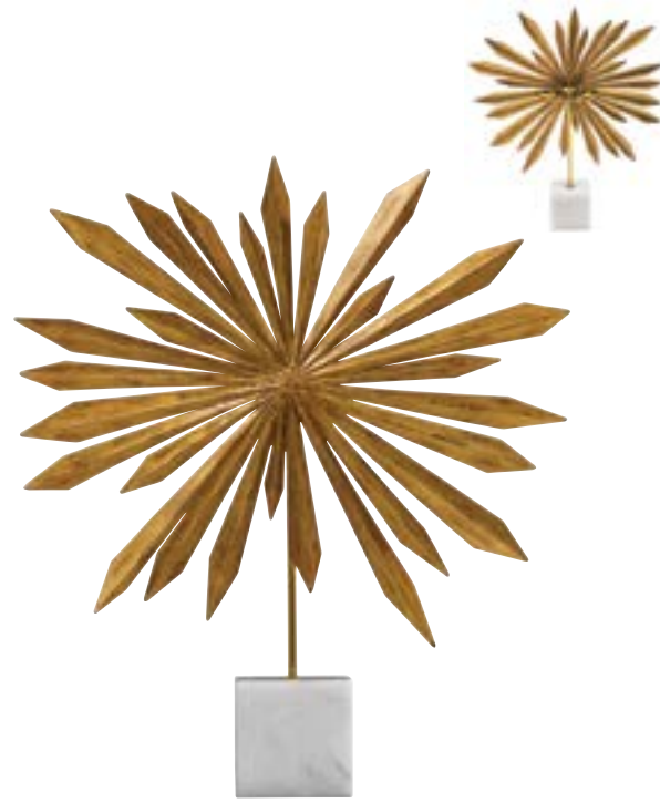
8198-16 Votive Sun (1643-036) Gold Leaf Metal Votive Candleholder on White Marble Base W22 D5 H25 Tony Duquette Collection