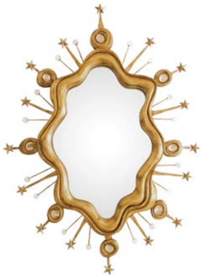
8275-28 Bijouterie Mirror (2848-316) Cast Resin Bijouterie Mirror in Satin Gold Gilt with Rock Crystal Accents W35 D2 H48 Tony Duquette Collection