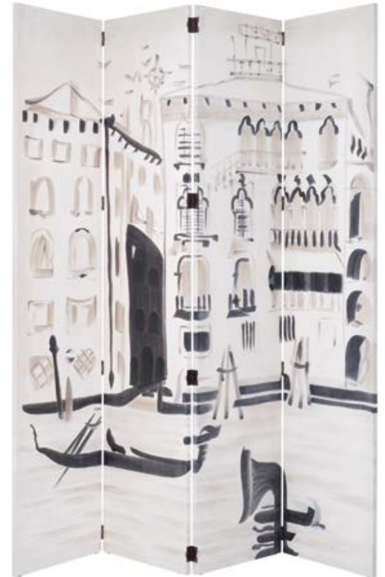
8106-27 Serenisima Screen (2743-558) Hand Painted Four Panel Canvas Serenisima Floor Screen, Gondola in Venice Decor, Back of Screen: Subtle Greek Key Design Around Perimeter of Each Panel W80 D2 H90 Tony Duquette Collection