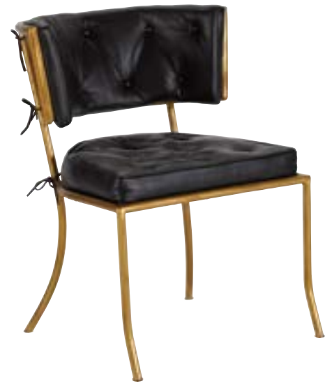
8114-43 Studio Klismos Game Chair (4351-036) Gilded Iron Studio Klismos Game Chair with Tie-On Galileo Black Leather Tufted Cushions W24 D27 H31 Tony Duquette Collection