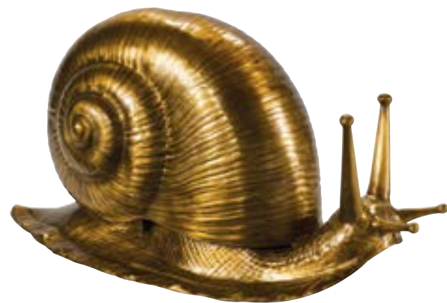
8285-10 Snailbate Garden Ornament (1054-352) Cast Brass Decorative Snail in Antique Brass Finish W37 D15 H18 Tony Duquette Collection