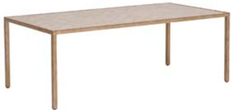
8154-33 Talmadge Cocktail Table (3351-349) Textured Silvery Gold Leaf Finished Iron Talmadge Cocktail Table with White Oyster Shell Inlay W54 D28 H18 Tony Duquette Collection