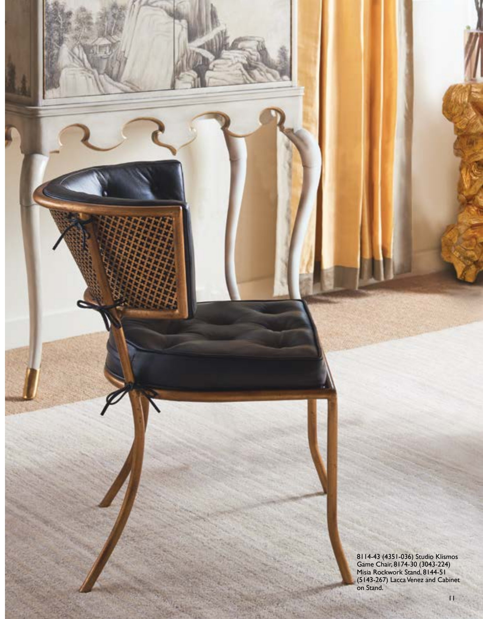
8114-43 (4351-036) Studio Klismos Game Chair, 8174-30 (3043-224) Misia Rockwork Stand, 8144-51 (5143-267) Lacca Venez and Cabinet on Stand.