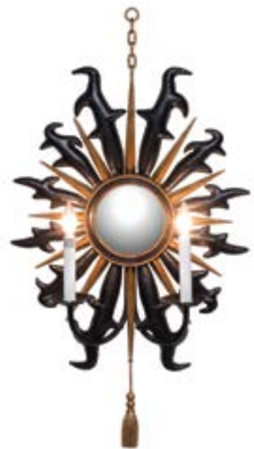
8133-19 The Eclipse Sconce (1951-297) 40W candelabra, 2 sockets Hammered Matte Black and Antique Gold Leaf Finished Wall Sconce, Tassel Accent W21 D7 H38 Tony Duquette Collection