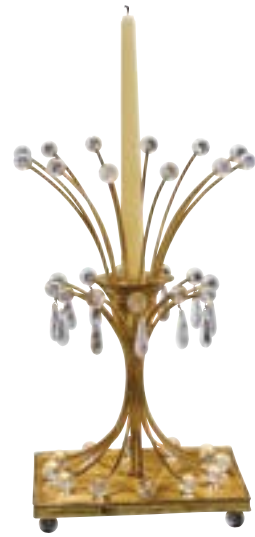
8197-16 Duque Candlestick (1654-749) Satina Gold Gilt Aluminum and Steel Duque Candlestick with Rock Crystal Beading W8 D8 H12 Tony Duquette Collection