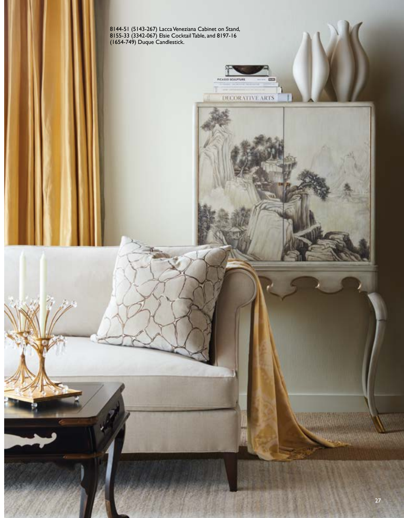
8144-51 (5143-267) Lacca Veneziana Cabinet on Stand, 8155-33 (3342-067) Elsie Cocktail Table, and 8197-16 (1654-749) Duque Candlestick.