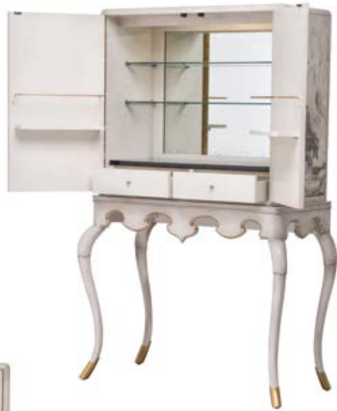
8144-51 Lacca Veneziana Cabinet on Stand (5143-267) Hand Painted Chinoiserie Bar Cabinet in Beige Lacquer with Gold Leaf Accents, Interior Lighting, Two Adjustable Glass Shelves, Black Waxstone Inlay on Bottom of Interior Cabinet, Antique Mirror Glass on Back of Interior Cabinet, Two Interior Drawers, Two Door Shelves W42 D20 H64 Tony Duquette Collection