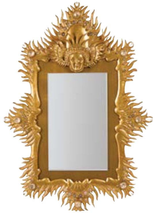
8273-28 Seraphim Mirror (2848-317) Gold Leaf Cast Resin Seraphim Mirror with Gold Eglomise and Rock Crystal Accents W40 D4 H56 Tony Duquette Collection