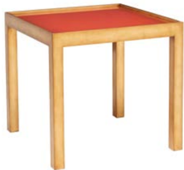
8153-32 Norma Lamp Table (3248-118) Gold Leaf Finished Norma Occasional Table with Coral Reverse Painted Inset Glass Top W26 D26 H25 Tony Duquette Collection