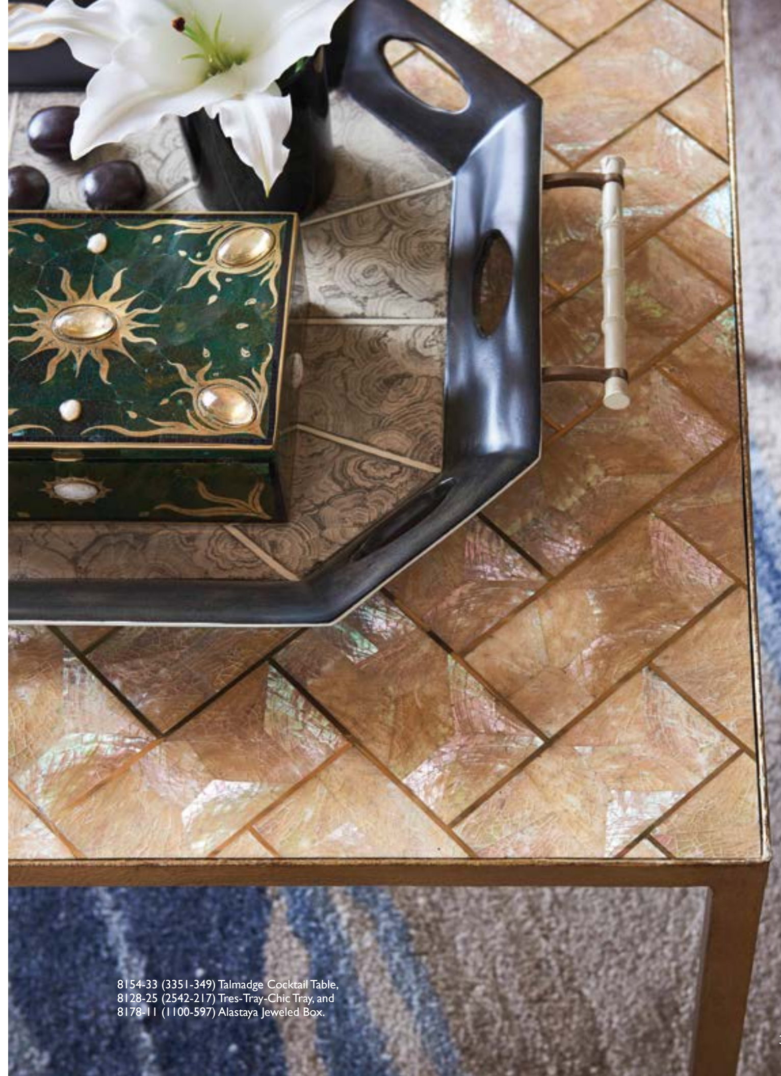
8154-33 (3351-349) Talmadge Cocktail Table, 8128-25 (2542-217) Tres-Tray-Chic Tray, and 8178-11 (1100-597) Alastaya Jeweled Box.