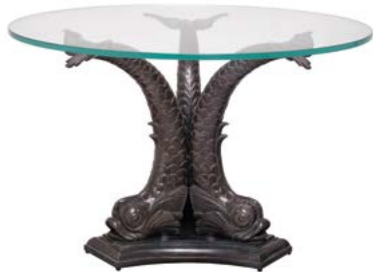
8169-30 Cete Table/8169-03 Glass Top (3053-214) Aged Bronze Verdigris Finished Center Table with Dolphin Decor, Tempered Glass Top W48 D48 H30 Tony Duquette Collection