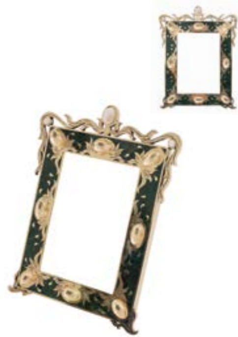
8190-12 Alastaya Jeweled Frame (1200-347) Cast Polished Brass Alastaya Jeweled Photo Frame with Dyed Green Panshell, Rock Crystals, Frame will Hold a 5x7 Picture W9 D1 H12 Tony Duquette Collection