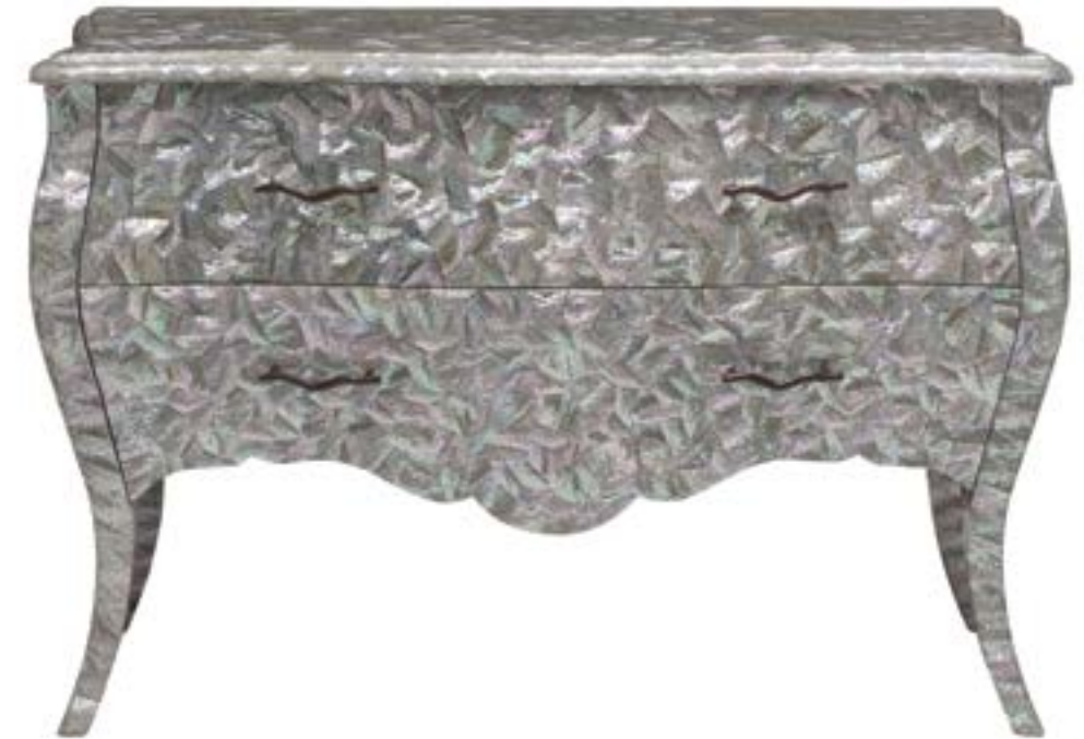
8110-50 Margarite Chest of Drawers (5000-111) Blue Abalone Shell Inlaid Margarite Chest of Drawers, Barcelona Bronze Brass Accents W50 D20 H34 Tony Duquette Collection