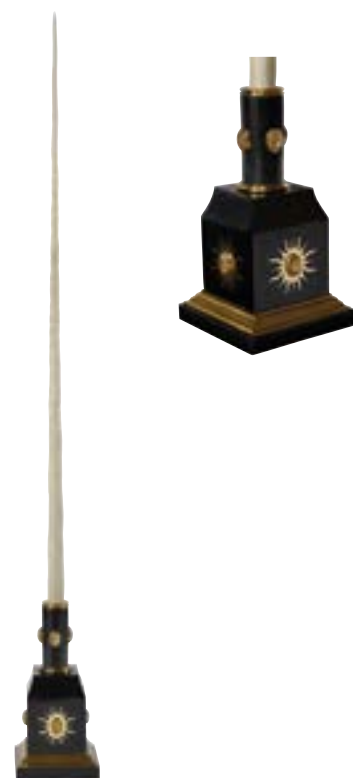
8283-10 Imperial Narwhal Tusk (1043-162) Cast Resin Imperial Narwhal Tusk on Black Waxstone with Brass and Rock Crystal Accents W10 D10 H94 Tony Duquette Collection