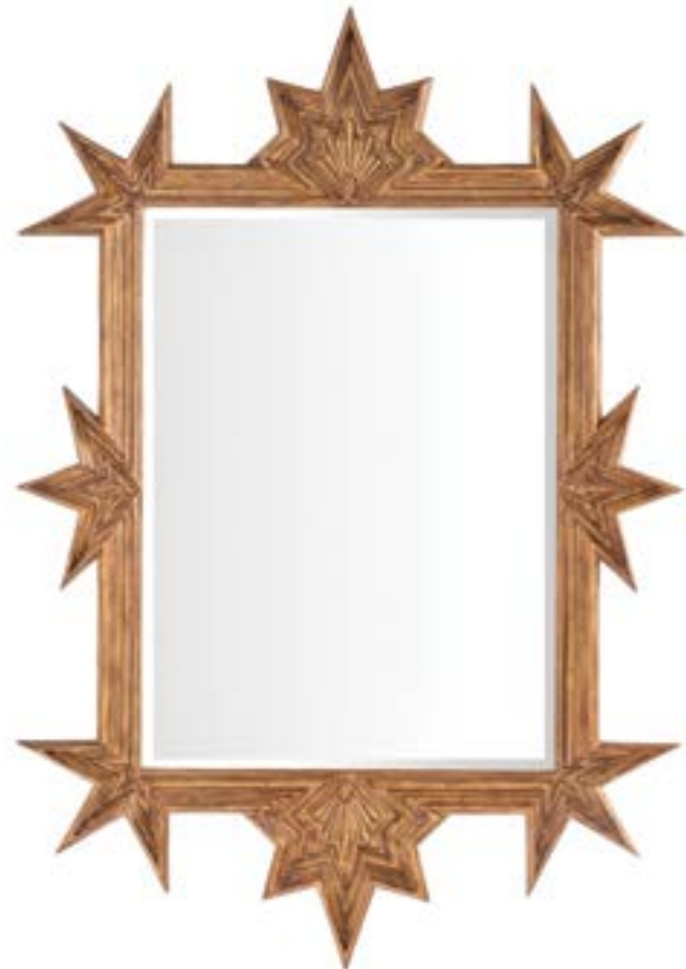
8274-28 Rinconada Mirror (2848-315) Cast Resin Rinconada Mirror in Rubbed Gold Leaf with Star Decor, Beveled Glass Note: Mirror may be hung horizontal or vertical W50 D3 H72 Tony Duquette Collection