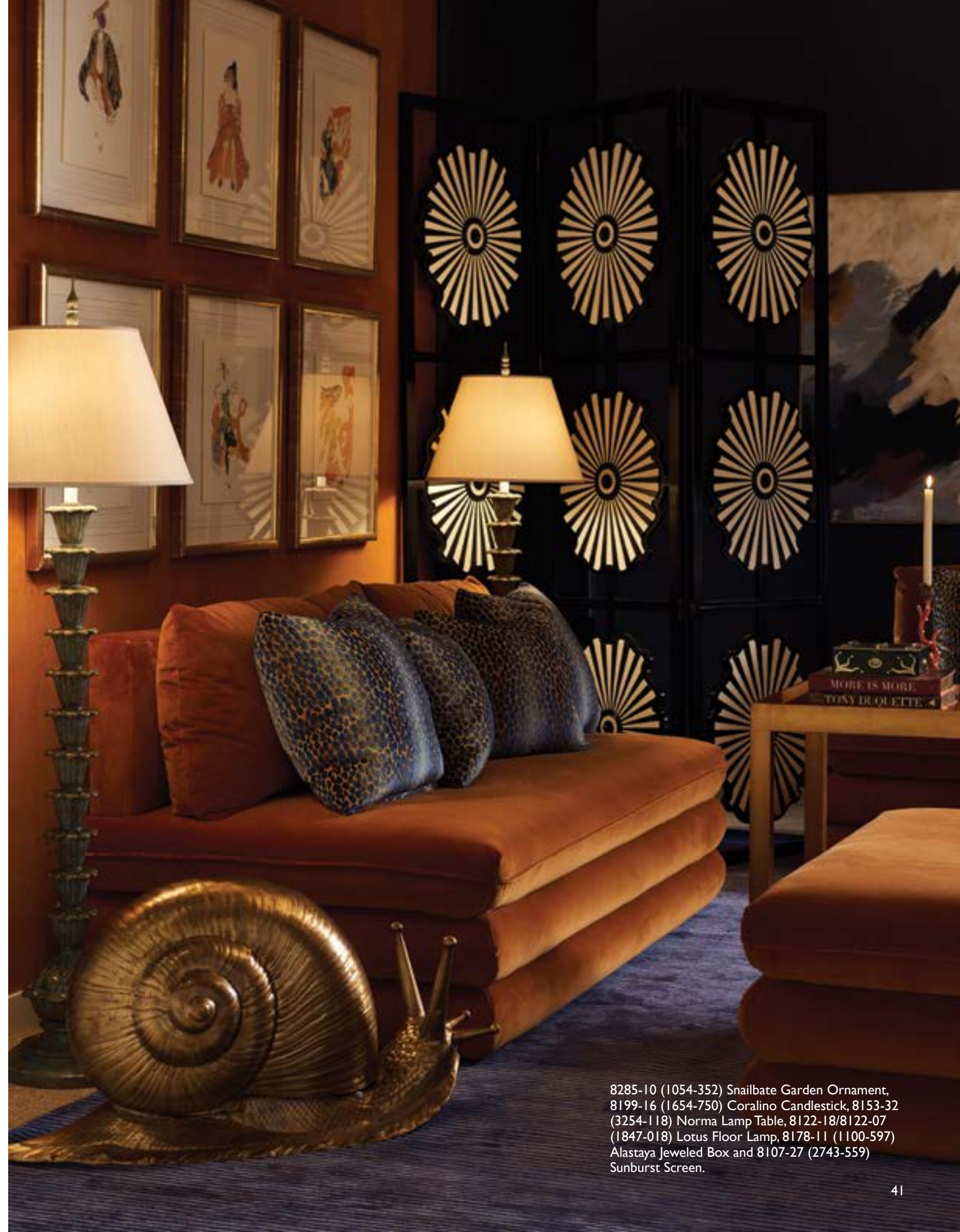
8285-10 (1054-352) Snailbate Garden Ornament, 8199-16 (1654-750) Coralino Candlestick, 8153-32 (3254-118) Norma Lamp Table, 8122-18/8122-07 (1847-018) Lotus Floor Lamp, 8178-11 (1100-597) Alastaya Jeweled Box and 8107-27 (2743-559) Sunburst Screen.