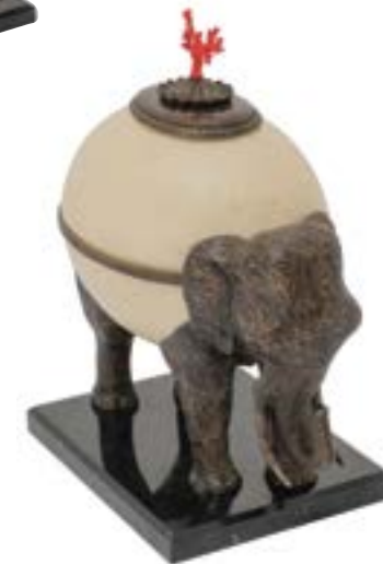
8169-21 Mactau Bowl (2154-600) Barcelona Bronze Finished Cast Brass Elephant with Lidded Faux Ostrich Egg Bowl W16 D9 H18 Tony Duquette Collection