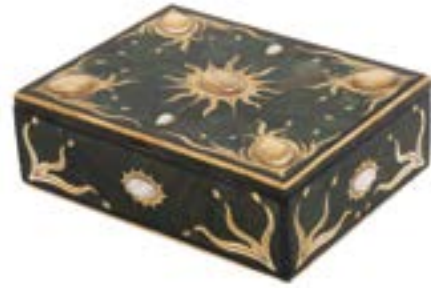
8178-11 Alastaya Jeweled Box (1100-597) Cast Polished Brass Alastaya Jeweled Box with Inlaid Dyed Green Panshell, Rock Crystals W9 D7 H3 Tony Duquette Collection