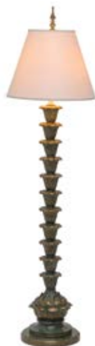
8122-18 Lotus Floor Lamp/8122-07 Shade (1847-018) 60W, 2 Sockets Cast Brass with Pompeian Bronze Finish, Off White Linen Shade W61 D11 H11 Tony Duquette Collection