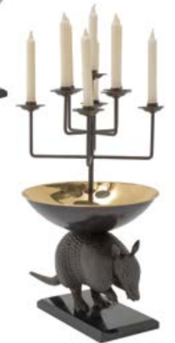
8284-10 Golden Armadillo (1054-353) Barcelona Bronze Finished Cast Brass Armadillo with Bowl or Candelabra on Waxstone Base W20 D14 H25 (W20 D14 H13¼ without Candelabra) Tony Duquette Collection