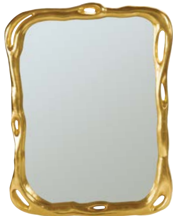
8276-28 Biomorphc Mirror (2848-314) Cast Resin Gold Leaf Biomorphc Mirror Note: Mirror may be hung horizontal or vertical W48 D5 H62 Tony Duquette Collection