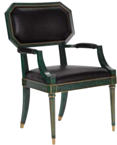
8115-43 Palagonia Desk Chair (4343-080) Seat Height: 18" Arm Height: 24¾" Painted Faux Malachite Finish Desk Chair, Galileo Black Leather Uph, Soft Brass Accent W24 D22 H34 Tony Duquette Collection