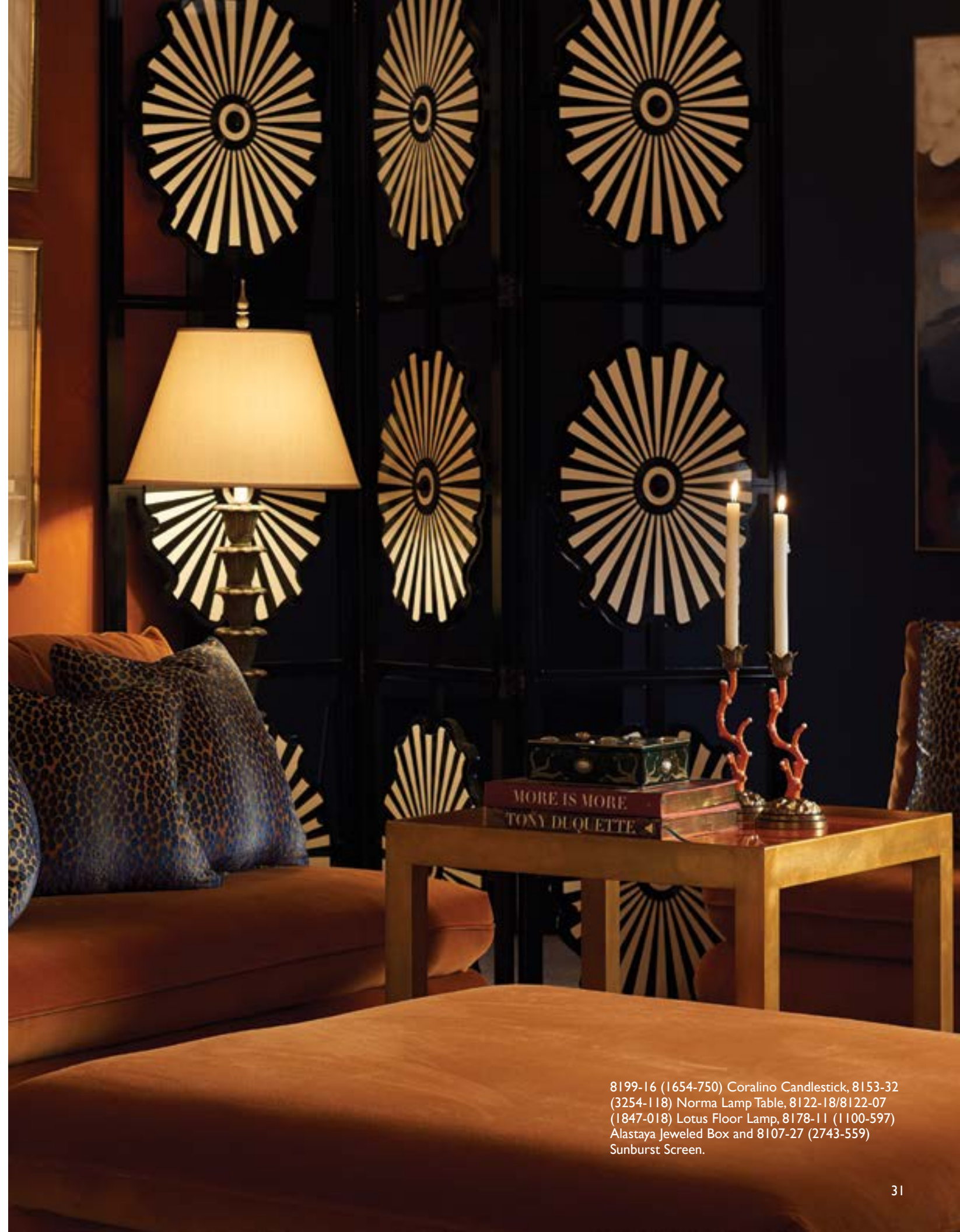
8199-16 (1654-750) Coralino Candlestick, 8153-32 (3254-118) Norma Lamp Table, 8122-18/8122-07 (1847-018) Lotus Floor Lamp, 8178-11 (1100-597) Alastaya Jeweled Box and 8107-27 (2743-559) Sunburst Screen.