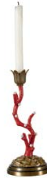
8199-16 Coralino Candlestick (1654-750) Coral Enamel and Antique Brass Finished Candlestick with Natural Pearl Accents W5 D5 H11 Tony Duquette Collection