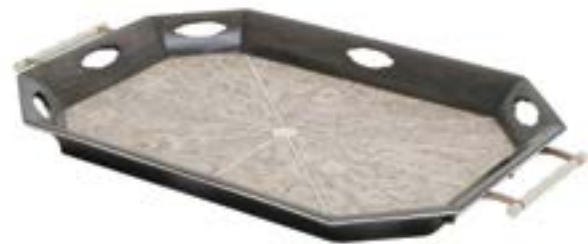
8128-25 Tres-Tray-Chic Tray (2542-217) Hand Painted Black and White Finished Faux Malachite Tray with Silver Antique Finish on Brass Handles W28 D18 H2 Tony Duquette Collection