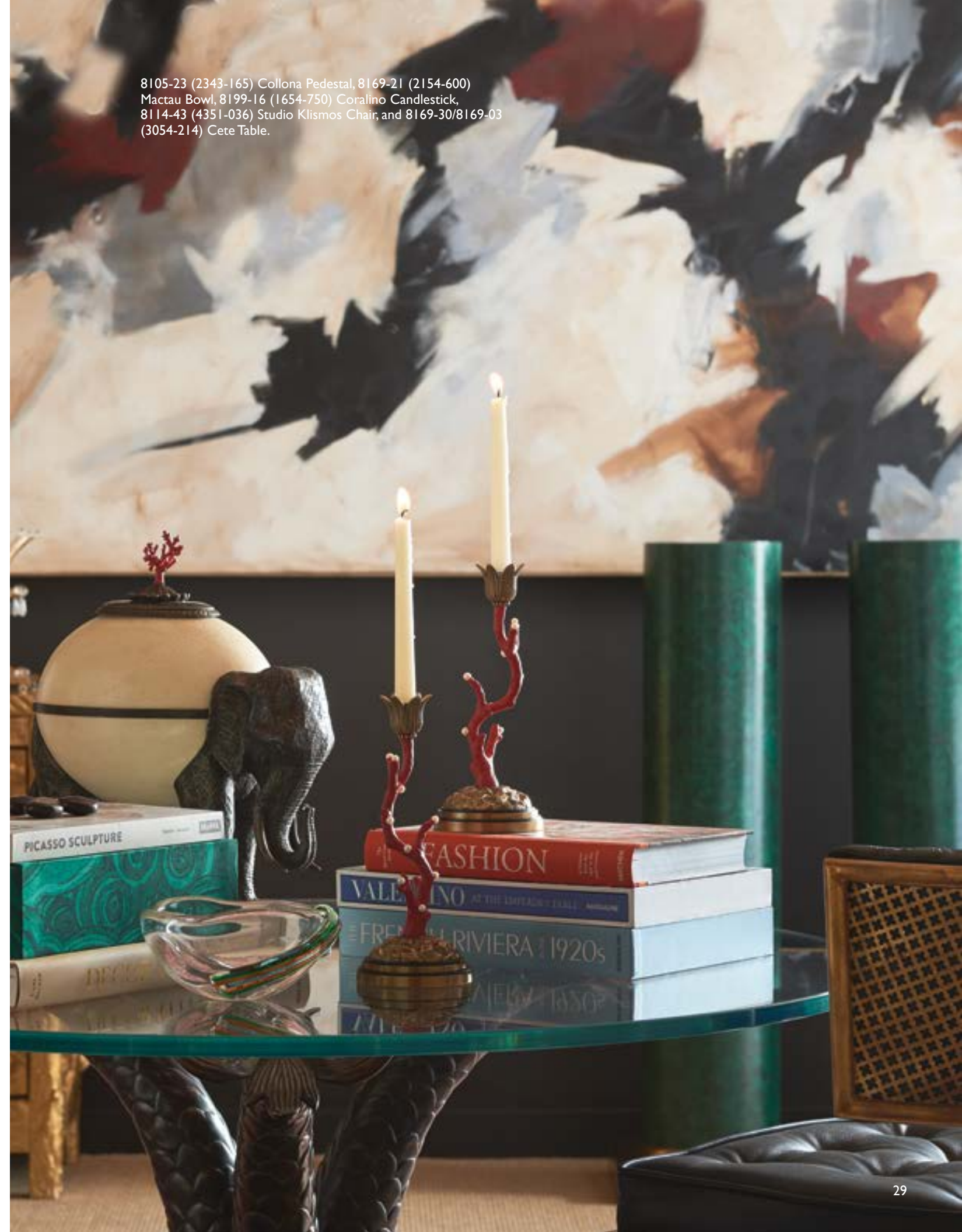
8105-23 (2343-165) Collona Pedestal, 8169-21 (2154-600) Mactau Bowl, 8199-16 (1654-750) Coralino Candlestick, 8114-43 (4351-036) Studio Klismos Chair, and 8169-30/8169-03 (3054-214) Cete Table.