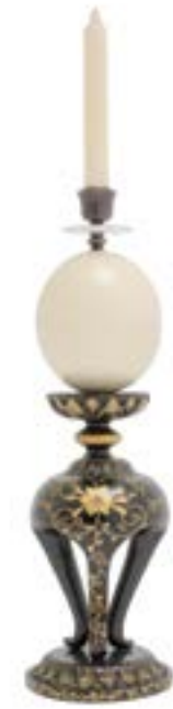
8196-16 Skikki Candlestick (1643-035) Aged Black Lacquer Shikki Candlestick, Hand Painted Gold Accents, Ostrich Egg Motif W6 D6 H19 Tony Duquette Collection