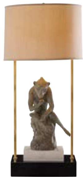
8211-17 Kong Lamp/8211-07 Shade (1743-222) 60W Antique Limed Finished Cast Brass Monkey Table Lamp, White Agate and Black Waxstone Base W13 D11 H35 Tony Duquette Collection