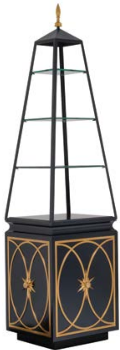
8109-53 Cleopatra's Needle (5330-642) Textured Black Lacquer Finished Open Etagere with Soft Brass Accent, Can Float in a Room, Brass Detail on All Four Sides of Base, One Cabinet Door, Interior Shelf is Not Adjustable W22 D20 H89 Tony Duquette Collection

8109-53 (5330-642) Cleopatra's Needle, 8154-33 (3351-349) Talmadge Cocktail Table, 8128-25 (2542-217) Tres-Tray-Chic Tray, 8177-11 (1143-434) Roi Soleil Jeweled Box, and 8178-11 (1100-597) Alastaya Jeweled Box.