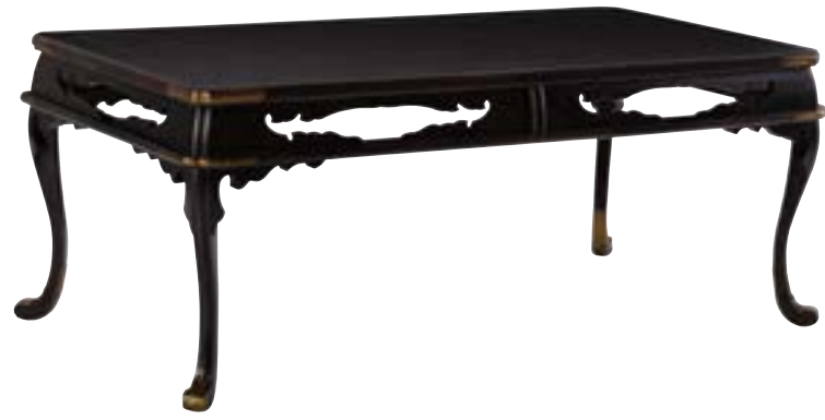
8155-33 Elsie Cocktail Table (3342-067) Aged Black Lacquer Finished Elsie Cocktail Table with Antique Brass Accents W50 D26 H20 Tony Duquette Collection