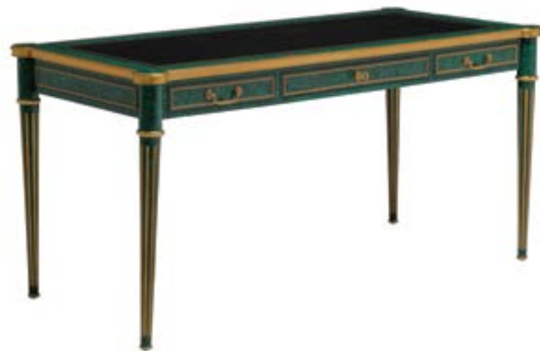
8115-55 Malaquita Desk (5530-358) Painted Faux Malachite Desk, Black Leather Inlay, Gold Tooling, Soft Brass Accents, Key Not Removable, Three Drawers across Front Only. W62 D29 H30 Tony Duquette Collection