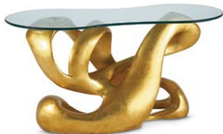
8167-34 Biomorphc Console/8167-03 Glass Top (3443-242) Cast Resin Gold Leaf Biomorphc Console Table with Glass Top W70 D36 H33 Tony Duquette Collection

8276-28 (2848-314) Biomorphc Mirror, 8167-03/ 8167-34 Biomorphc Console, 8133-19 (1951-297) The Eclipse Sconce, 8198-16 (1643-036) Votive Sun, and 8199-16 (1654-750) Coralino Candlestick, 8169-21 (2154-600) Mactau Bowl.