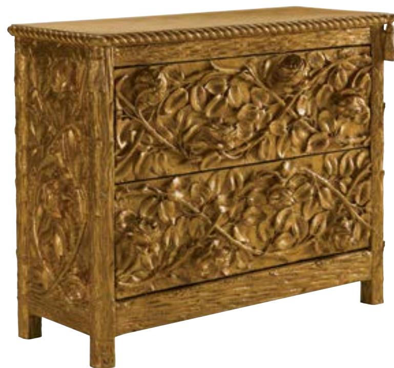
8111-50 The Rose Chest of Drawers (5048-004) Antiqued Satina Gold Gilt Finished Rose Chest of Drawers W47 D19 H37 Tony Duquette Collection