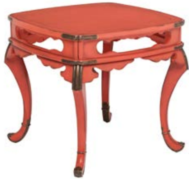
8154-32 Elsie Lamp Table (3243-245) Aged Persimmon Lacquer Finished Elsie Occasional Table with Monticello Brass Accents W27 D27 H26 Tony Duquette Collection